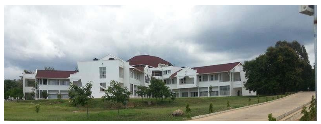
NM-AIST Administration – cum- Academic Complex