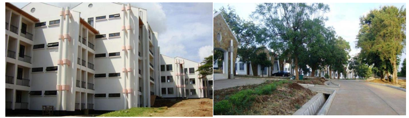
Students' Hostels at NM-AIST

Arusha is a relatively cool place and therefore, students are advised to bring warm beddings and clothes.