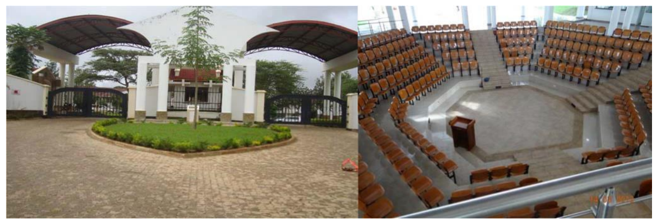
NM-AIST Main gate Amphitheatre

Registration after the first week shall be charged TZS 50,000.00 (USD 30) for Master's and TZS 100,000.00 (USD 50) for PhD students as a late registration fee stipulated in fees structure. Note that, consideration for late registration for the degree programme by coursework and dissertation/project will be within 14 days after commencement of studies. After 14 days of commencement of studies no student will be registered into respective academic year as per NM-AIST Regulations.