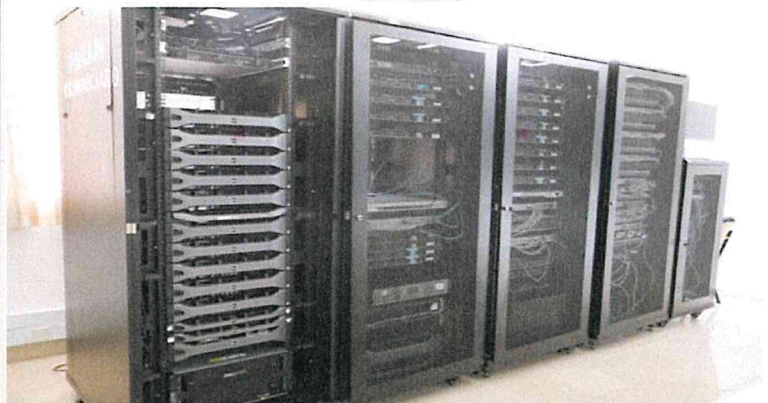
Param - Kilimanjaro Super Computer