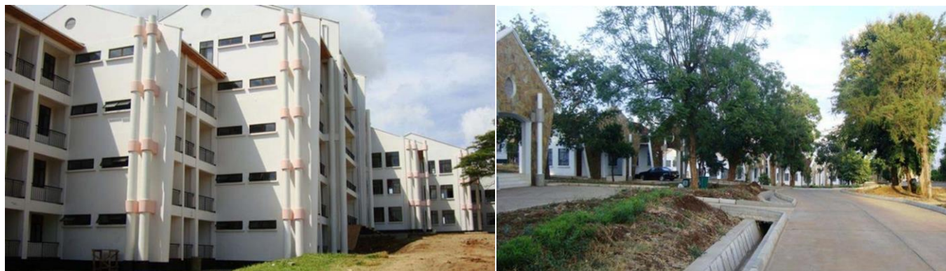
Students' Hostels at NM-AIST

Arusha is a relatively cool place and therefore, students are advised to bring warm beddings and clothes.