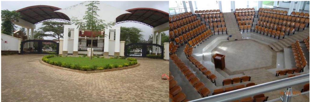
NM-AIST Main gate Amphitheatre

Registration after the first week shall be charged TZS 50,000.00 (USD 30) for Master's and TZS 100,000.00 (USD 50) for PhD students as a late registration fee stipulated in fees structure. Note that, consideration for late registration for the degree programme by coursework and dissertation/project will be within 14 days after commencement of studies. After 14 days of commencement of studies no student will be registered into respective academic year as per NM-AIST Regulations.