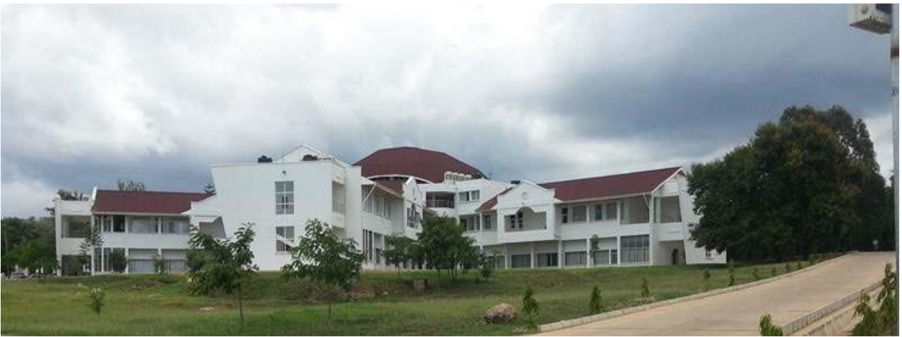
NM-AIST Administration – cum- Academic Complex